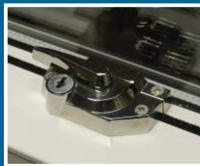
Attractive Key Locking Fitch Catch