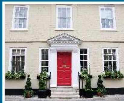
Traditional Residential Installation

This is a new product, which is still in development. E.&O.E.