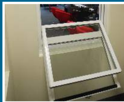
Tilt-In Facility For Easy Cleaning