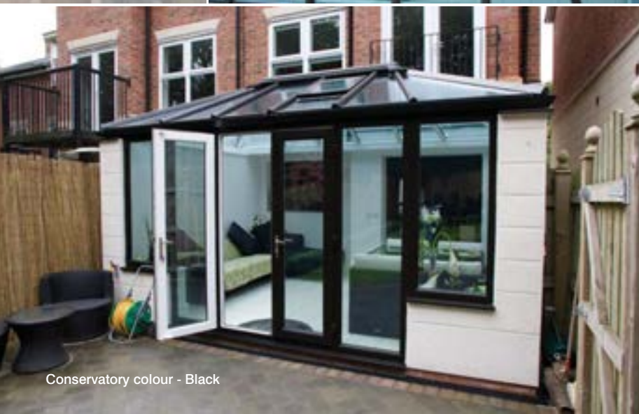
Conservatory colour - Black

Colour - applied correctly - has a profound positive effect on your wellbeing. It strongly influences how we interact with each other and our surroundings. So what can you consider for your home and conservatory? Consider this:-