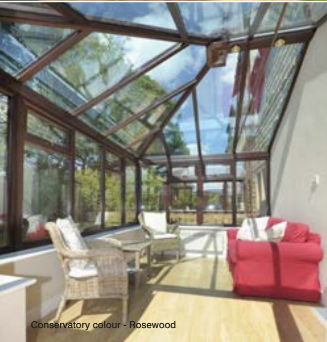
Conservatory colour - Rosewood