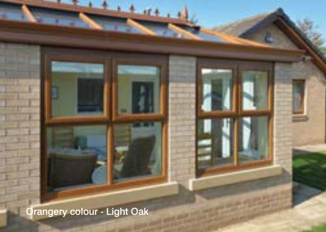
Orangery colour - Light Oak