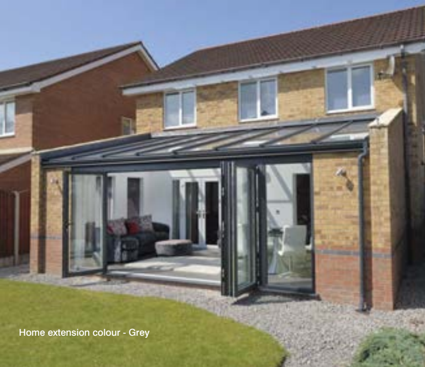
Home extension colour - Grey