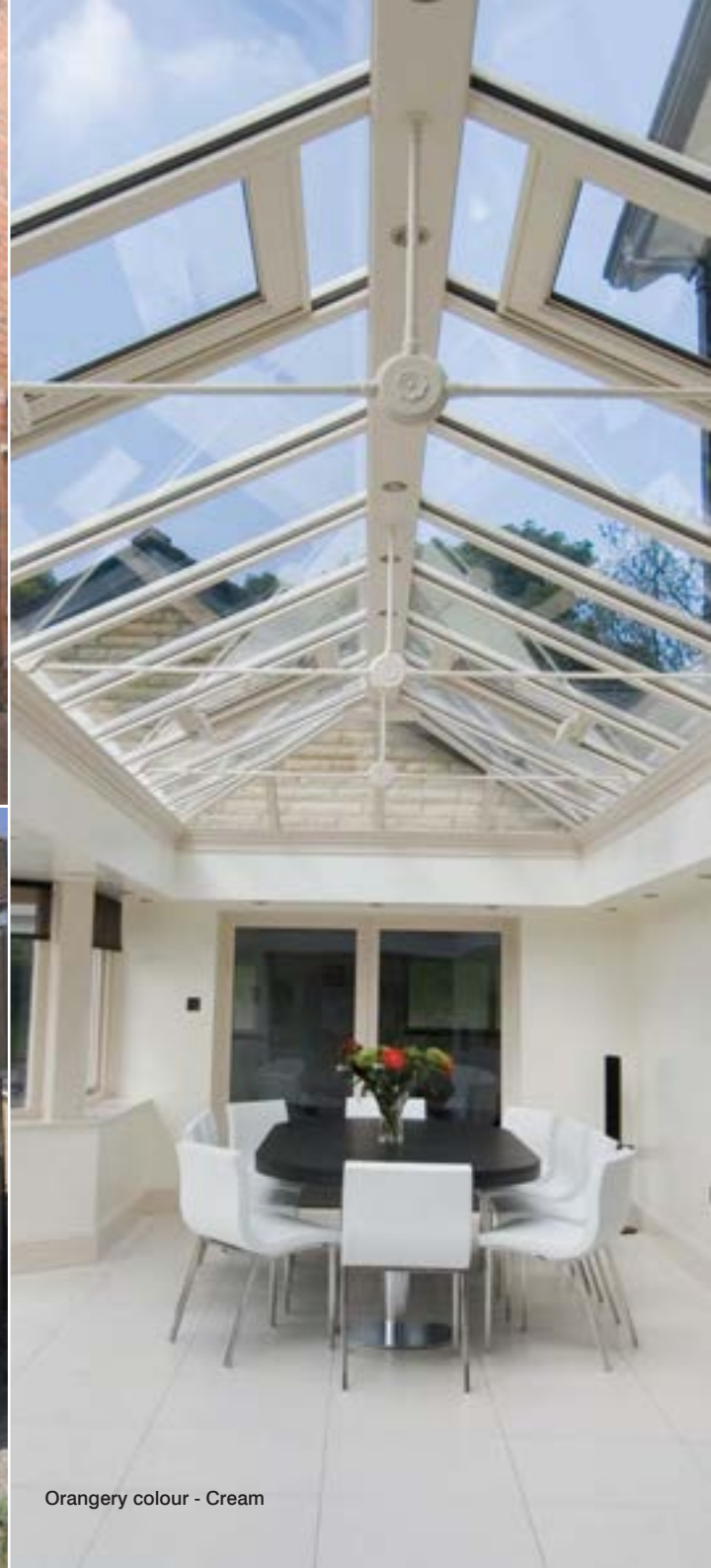
Orangery colour - Cream