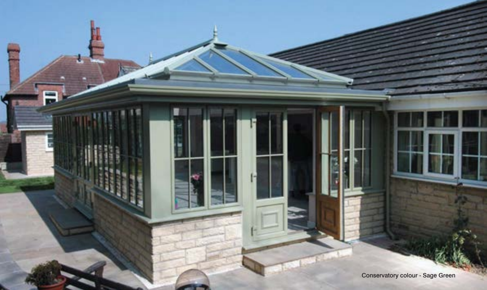
Conservatory colour - Sage Green