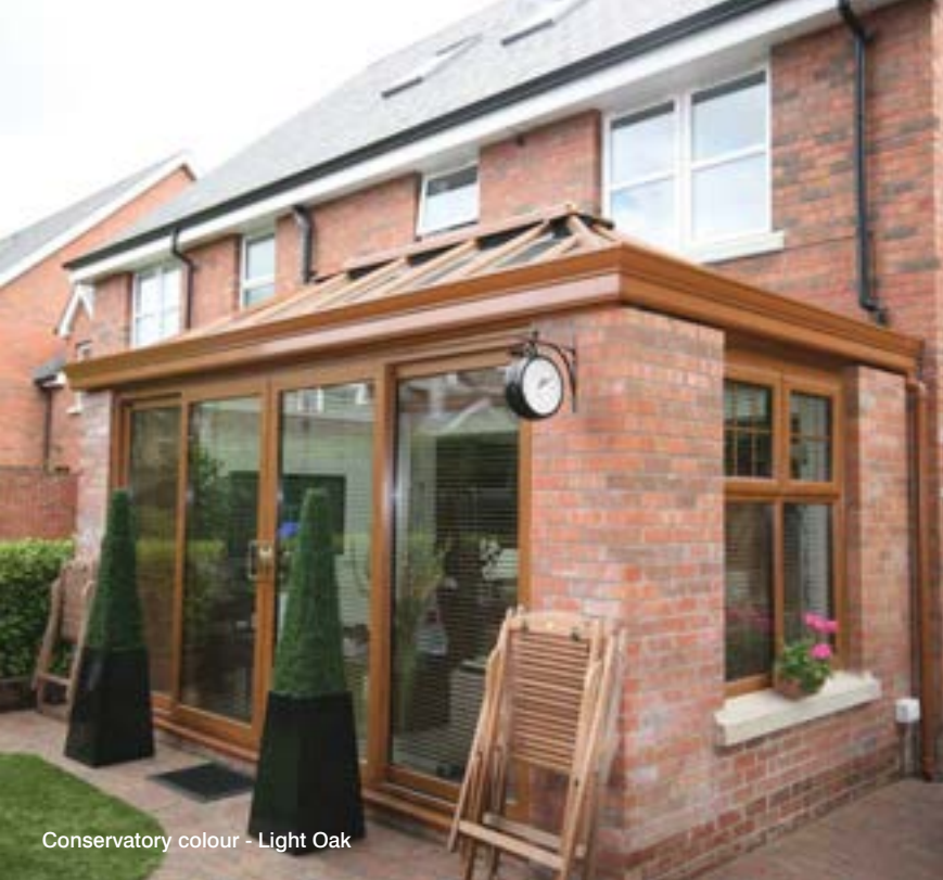
Conservatory colour - Light Oak