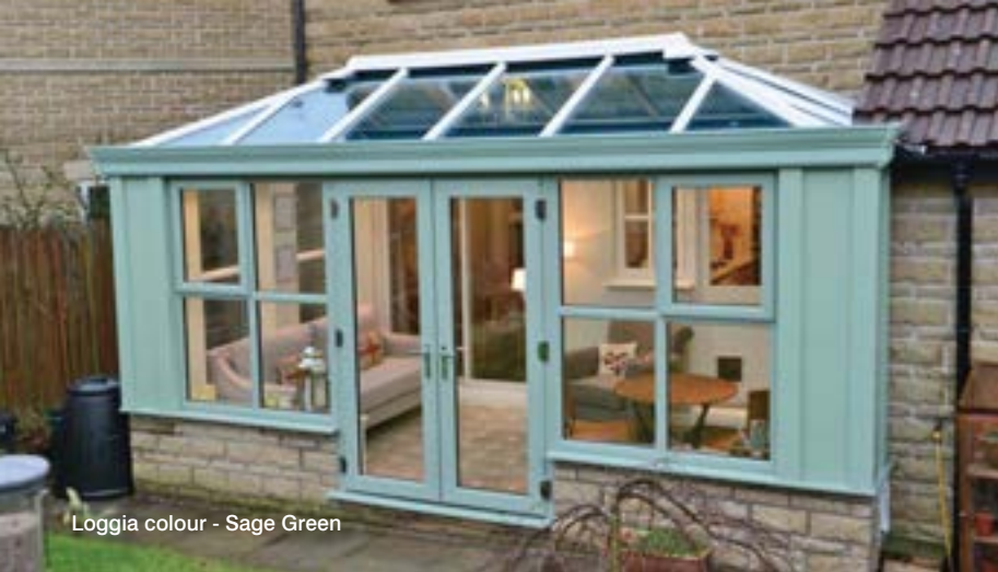
Loggia colour - Sage Green