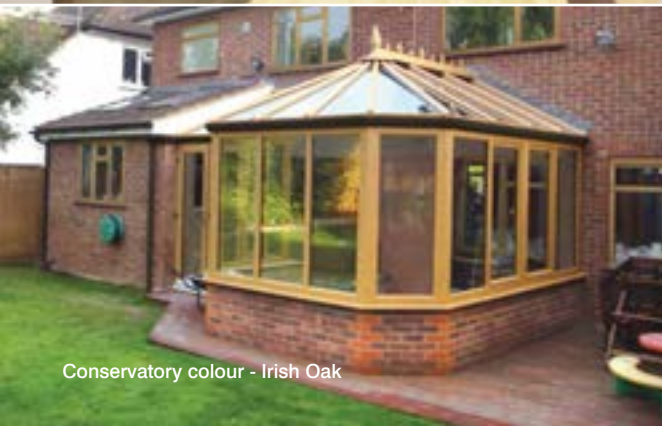
Conservatory colour - Irish Oak