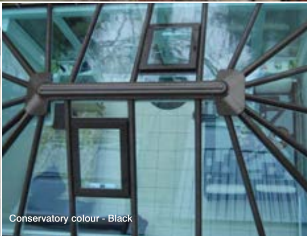
Conservatory colour - Black