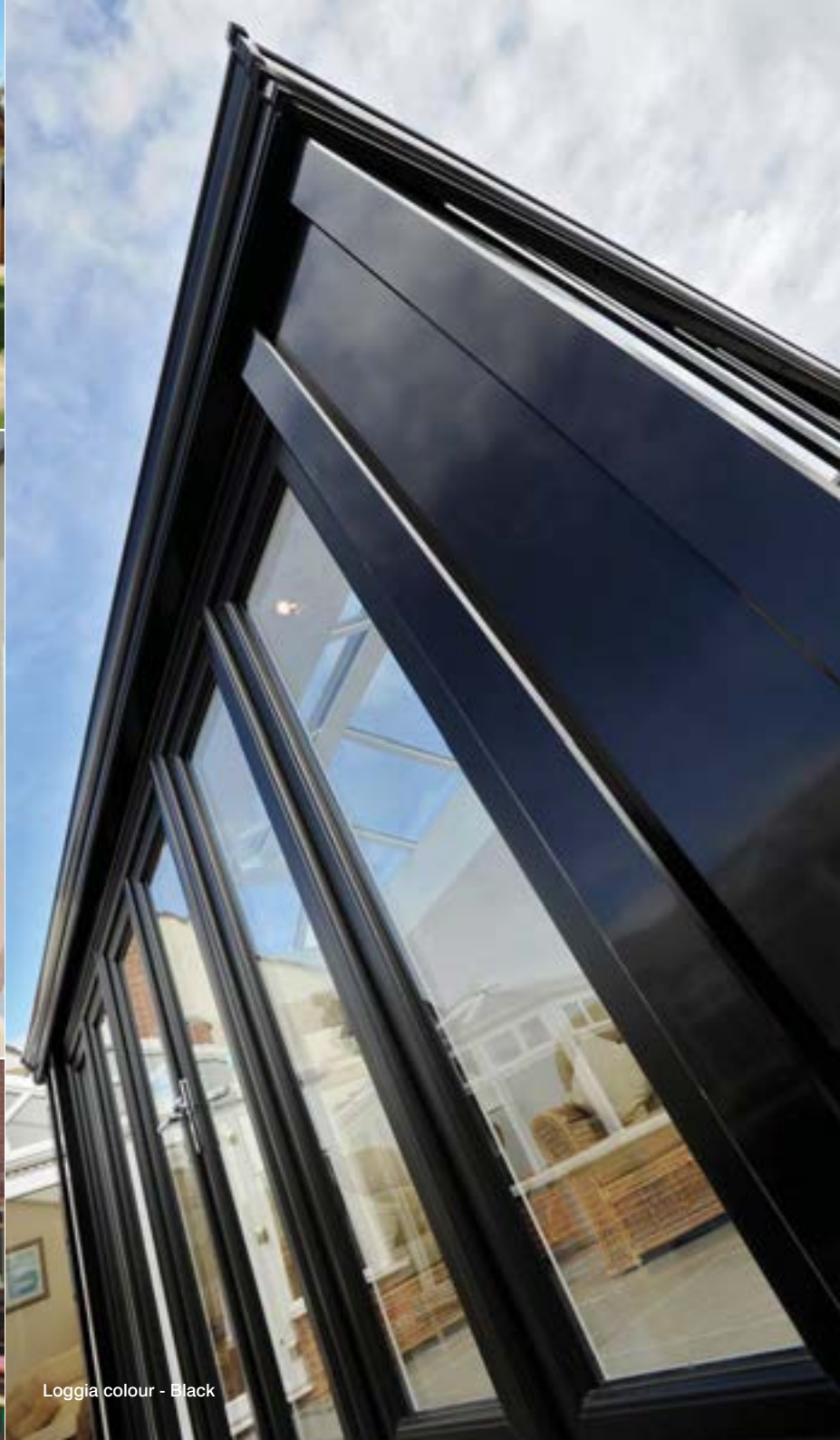
Loggia colour - Black