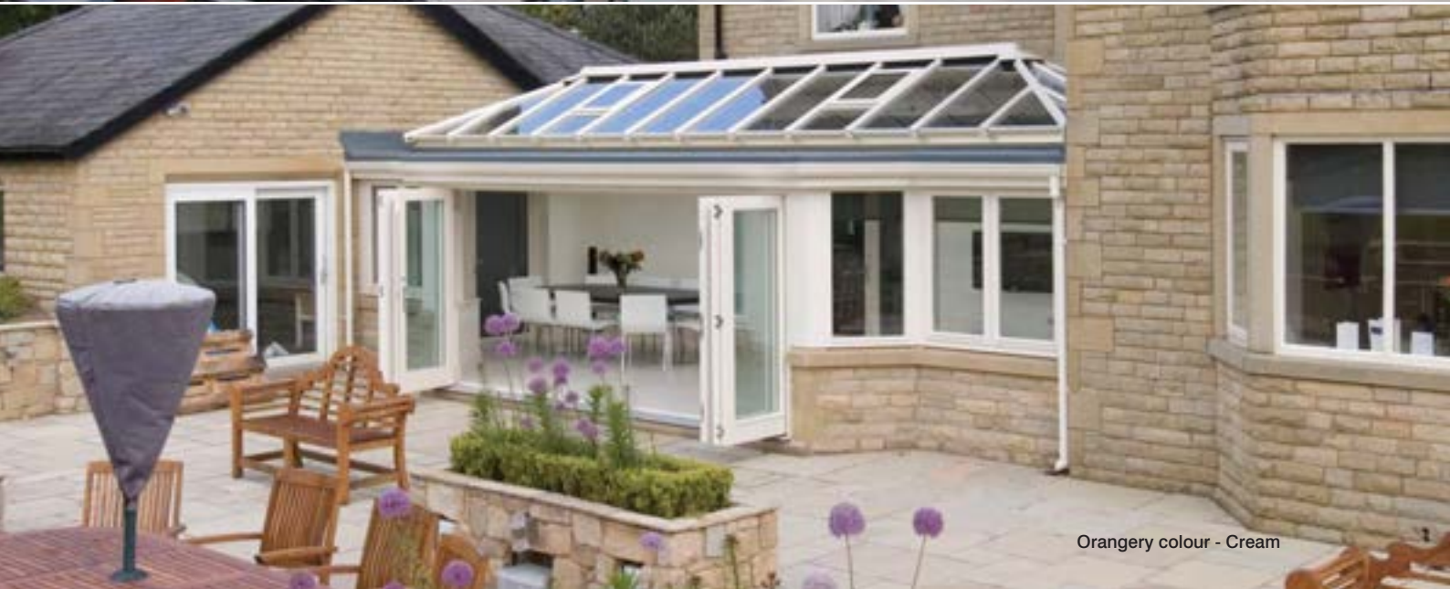
Orangery colour - Cream