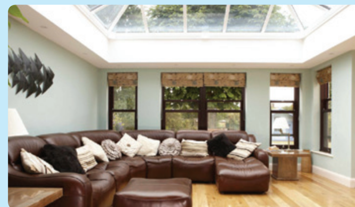
'Livin Room' internal pelmet