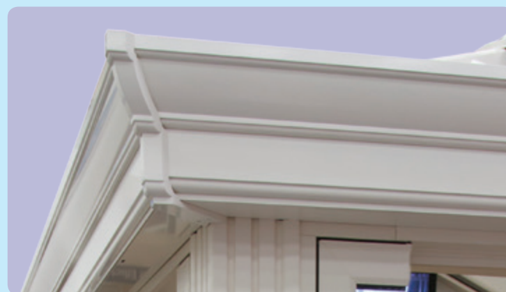
'Livin Room' optional cornice detail