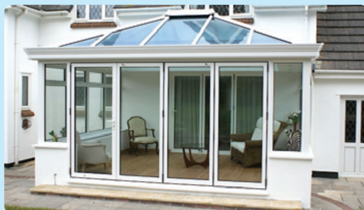
'Livin Room' orangery with aluminium frames and multifolding door

The 'Livin Room' Orangery is the best of both worlds, combining light and space of a conservatory with the walls and ceiling of an extension.