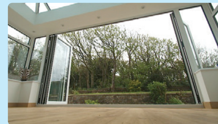
'Livin Room' incorporating aluminium multifolding doors